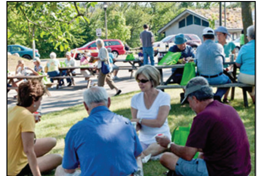
Meet at the Margot Picnic Shelter A

For informaton about what to do at the Arb' and how to get there, go to the website using the link above or see the map below.