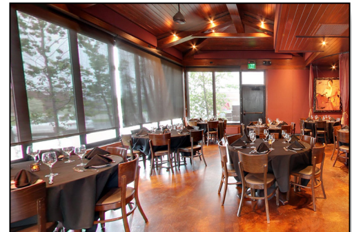
Four Seasons Room at Crave American Kitchen

For driving directions, go to the website using the link above or see the map below. The Galleria is across the street from Southdale.